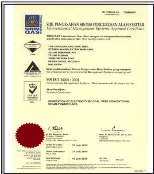
Environment Management System: ISO 14001:2004 Achievement by Generation