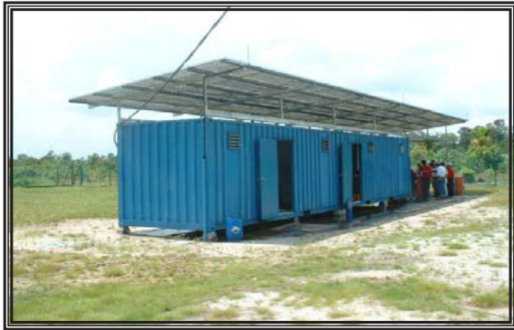
Stand Alone Photovoltaic System

The Stand Alone Photovoltaic System at Kg. Denai, Rompin is installed with a performance monitoring system to enable analysis of the system's performance and measure of reliability. The performance monitoring system is capable of retrieving data from the solar hybrid station (Kg. Denai) to the main office (TNBR). The two stations are located approximately 350 kilometers from one another. Short Messaging System (SMS) technique is used to transfer data from the station to the main office. The communication system also has the capability to notify end user should there be any malfunctions and failures.