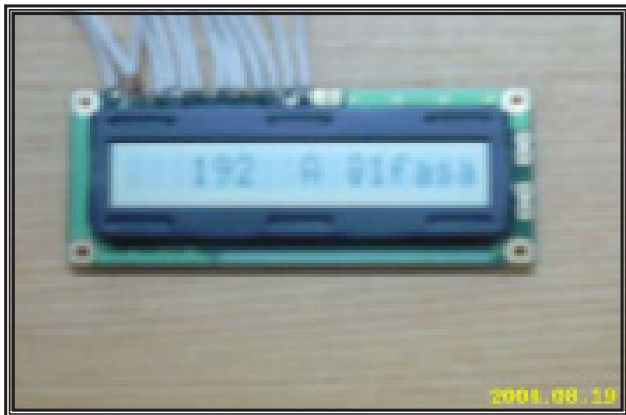
EFI Current Flow Indicator