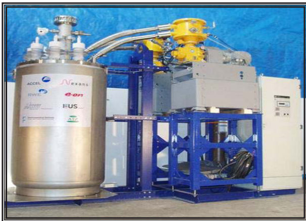
Superconducting Fault Current Limiter (Germany)