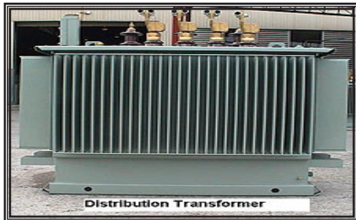
A Distribution Transformer by MTM