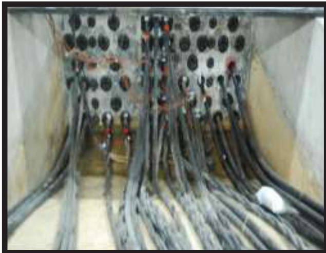
Example of Putrajaya Underground Cable Installation