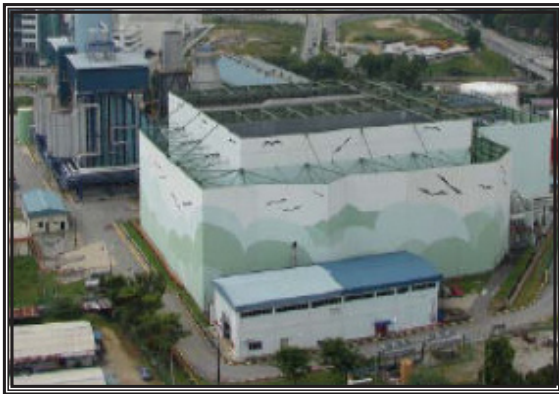
Gelugor Station Air Cooled Condenser