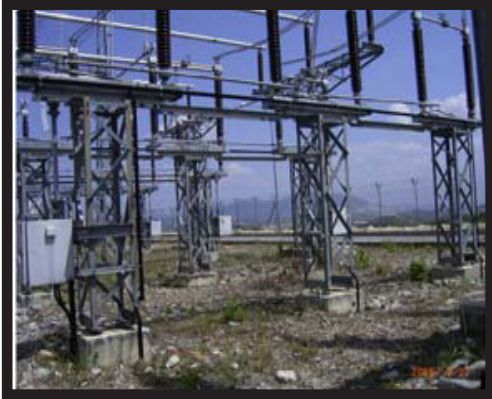
Galvanised Steel Lattice Support Structures in Substation